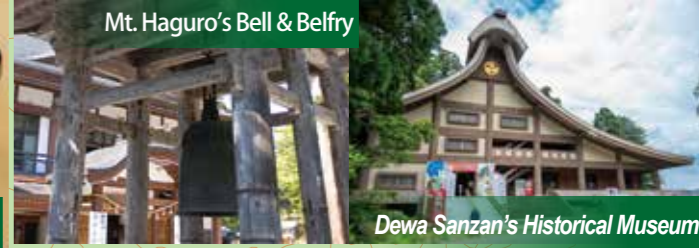
Mt. Haguro's Bell & Belfry