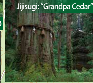
Jijisugi: "Grandpa Cedar"