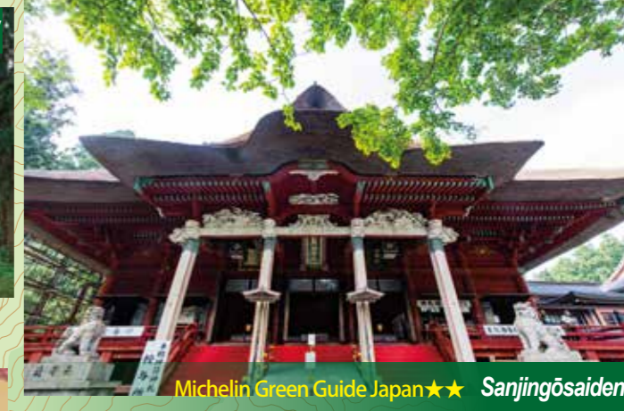
Michelin Green Guide Japan ★★ Sanjingōsaiden