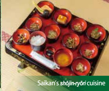
Saikan's shōjin-ryōri cuisine