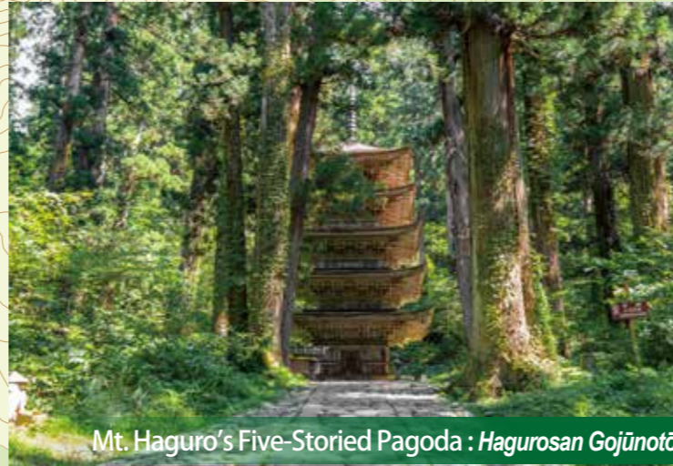
Mt. Haguro's Five-Storeyed Pagoda : Hagurosan Gojūnotō