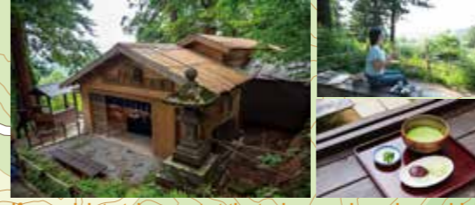
If you wish to take a rest at the teahouse, please buy a drink or a snack, it will contribute to the maintenance fees! Thank you!

National Treasure Mt. Haguro's Five Storeyed Pagoda Hagurosan Gojūnotō