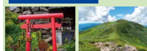
Kaji Inari Shrine Mt. Ubagatake