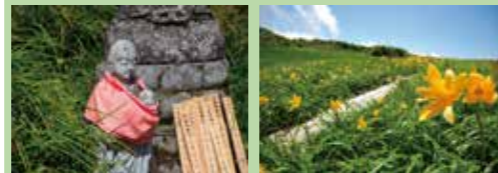
Jizō Buddhist statues Native flowers