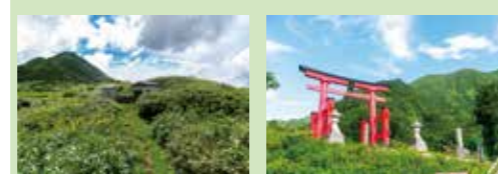
Shōzokuba crossing (turn right to go to Mt. Yudono) Yudonosan Senninzawa